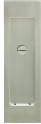
FH2704 Flush Pull w/ Thumbturn Release